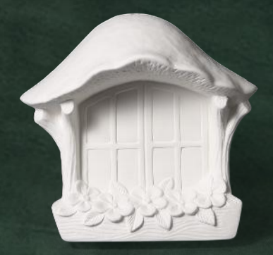
MB1500 Fairy Window w/Awning 5.5"H x 5.75"W x 2.5"D 6/case